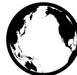
Southeast Asia & Oceania