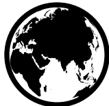
Central & South Europe