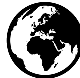
Africa & Middle East